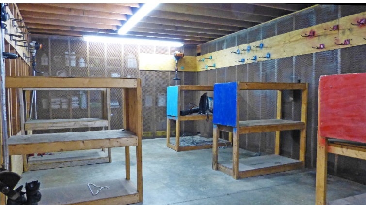
One of two Secure Tool Rooms