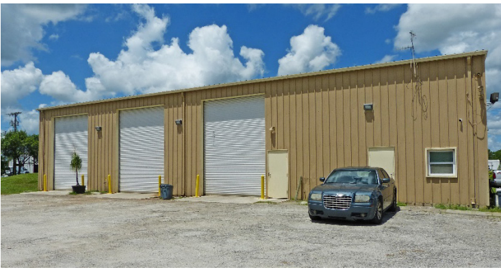
East Side of 5,5950sf Shop: Six 16' X 12' Roll Doors