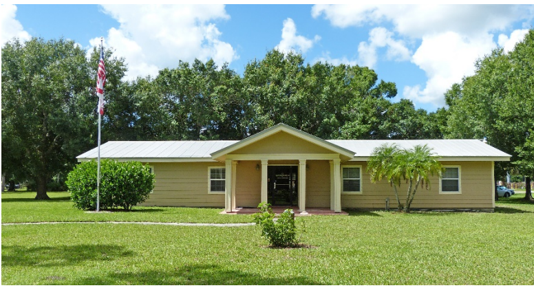
2,312sf Office Bldg: 5 Spacious Offices, Lobby, Reception, Conference, Gym, Kitchenette, 2 Restrooms, 3 Entrances