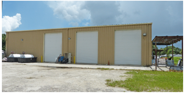
West Side: opposing doors allow drive-thru servicing. 2 Fuel Tanks: Gas & Diesel