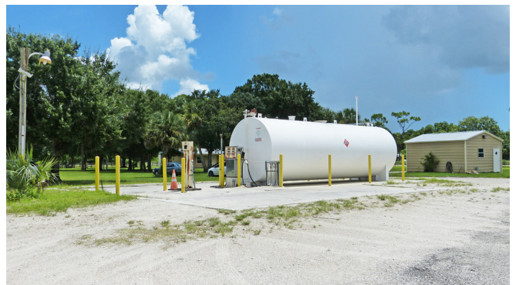
10,000 gallon Fuel Tank with Pump