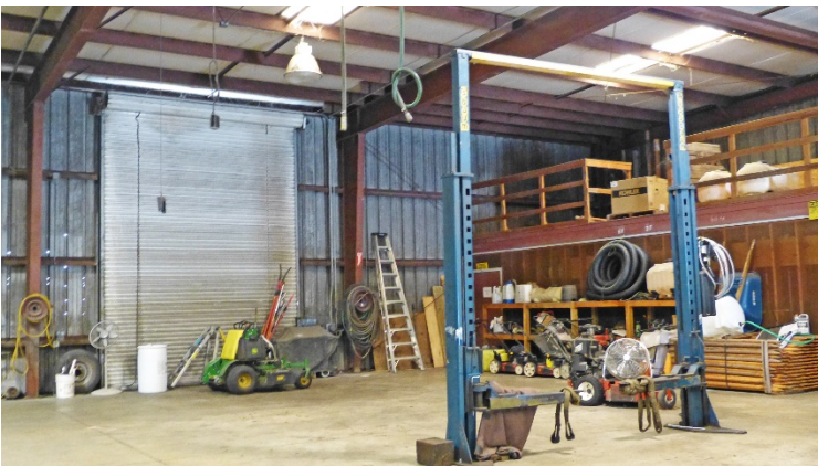
Heavy Duty Lift