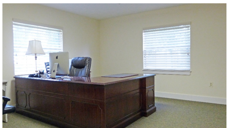
One of 4 additional Offices