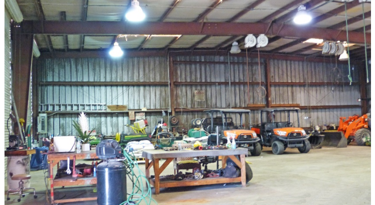
Insulated Roof w Skylights