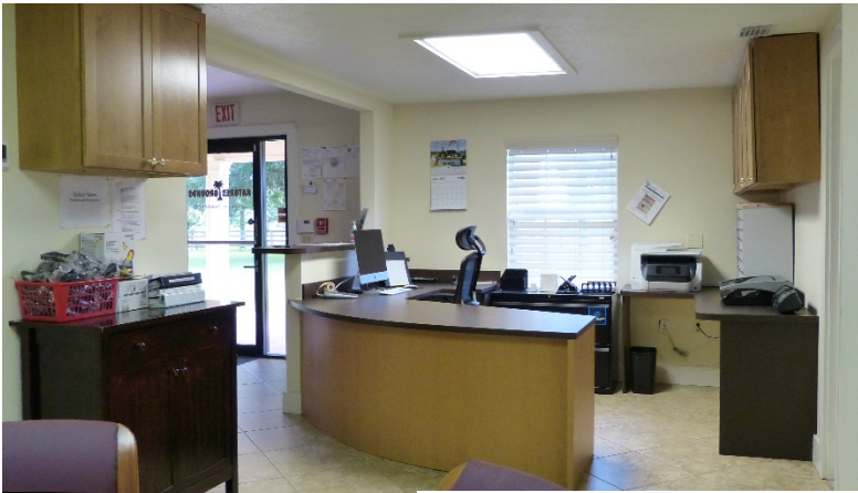
Reception Desk and Conference Area in same room