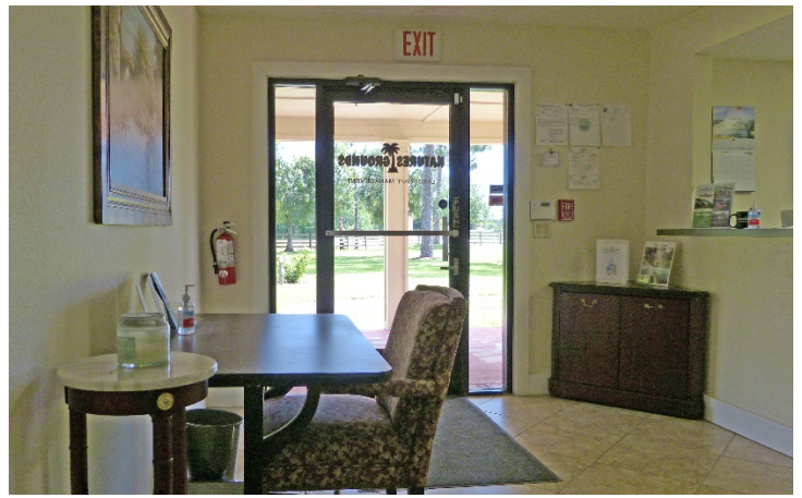
Front Entrance & Lobby