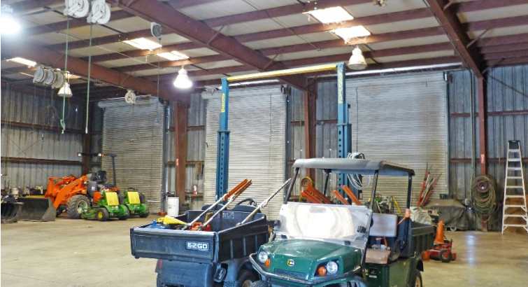
Overhead Compressed Air lines