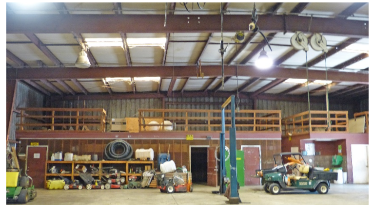
Mezzanine Storage rated @ 80lbs/sf w Forklift loading. 2 Secure Tool Rooms, Ice Room, Restroom beneath.